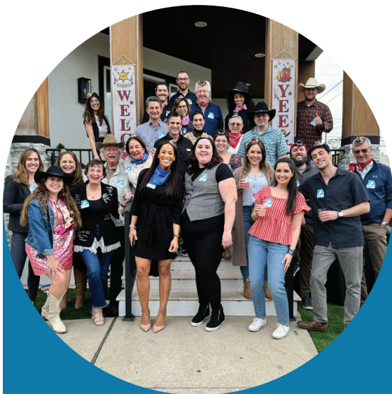
2024 Board of Directors